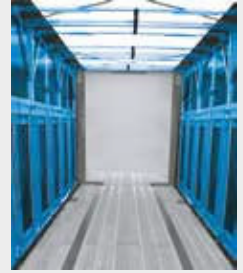
Interior of the body